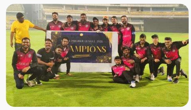
Team Kolkata, Winner